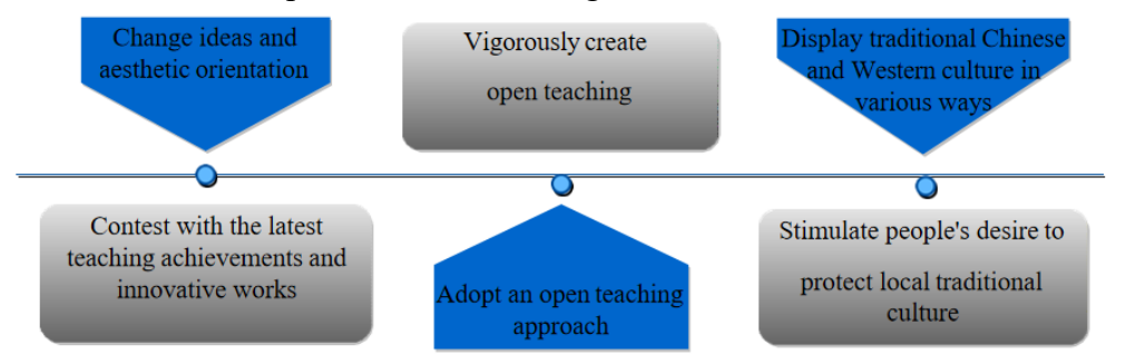
Figure 2 Teaching strategy of combining music teaching mode with Chinese and western traditional culture

The goal of music teaching in colleges and universities is not only to teach students to sing or play music, but also to let students know the traditional cultural background and feel the strong regional characteristics of music, so as to better protect, inherit and develop local traditional culture and promote the development of music education in colleges and universities [10]. In this paper, the teaching strategy of combining music teaching mode with Chinese and western traditional culture can be described from three aspects, as shown in Figure 2.